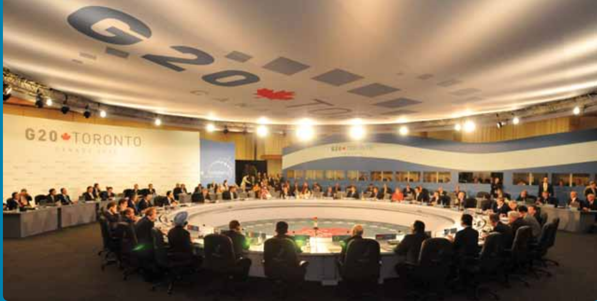
The British Prime Minister's Office

record $54.4 billion. China also is the world's leading producer of wind turbines and solar modules. In 2009, it surpassed the United States as the country with the most installed clean energy capacity.